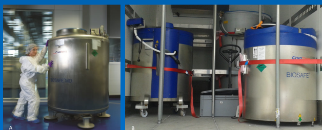
Fig. 1: Cryostorage vessels. A: Cryostorage tank, technologically modified with hover cushion brackets; B: Cryostorage tanks, technically modified with vacuum isolation stabilizers, clamped in HGV.

Our intention was, to establish a secure relocation system of entire cryostorage tanks containing cryopreserved sample collections with closed cooling chain and minimized external impacts to prevent any changes in the cryopreserved samples.